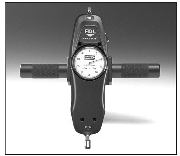
FDL shown with optional handles.